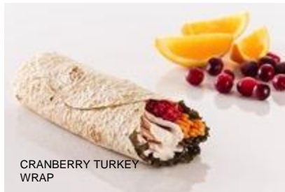
CRANBERRY TURKEY WRAP

380 cal M VG Creamy hummus topped with baby spinach, grilled eggplant and peppers, kalamata olives and tomato cucumber relish. $16.99 per guest