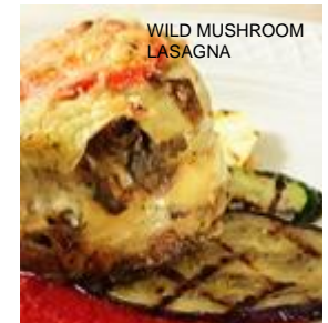
WILD MUSHROOM LASAGNA