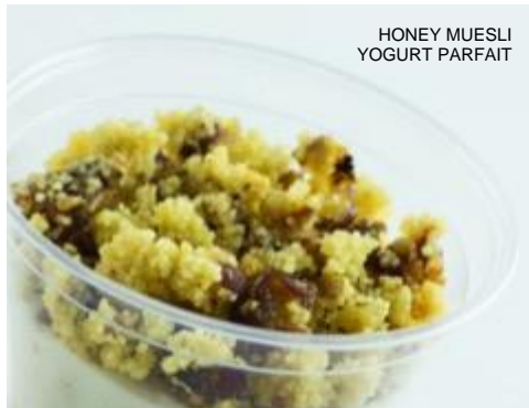
HONEY MUESLI YOGURT PARFAIT

340 cal V VG Sliced apples folded into pancake batter with cooked quinoa, cinnamon, and sugar and served with maple syrup. $4.99 per guest